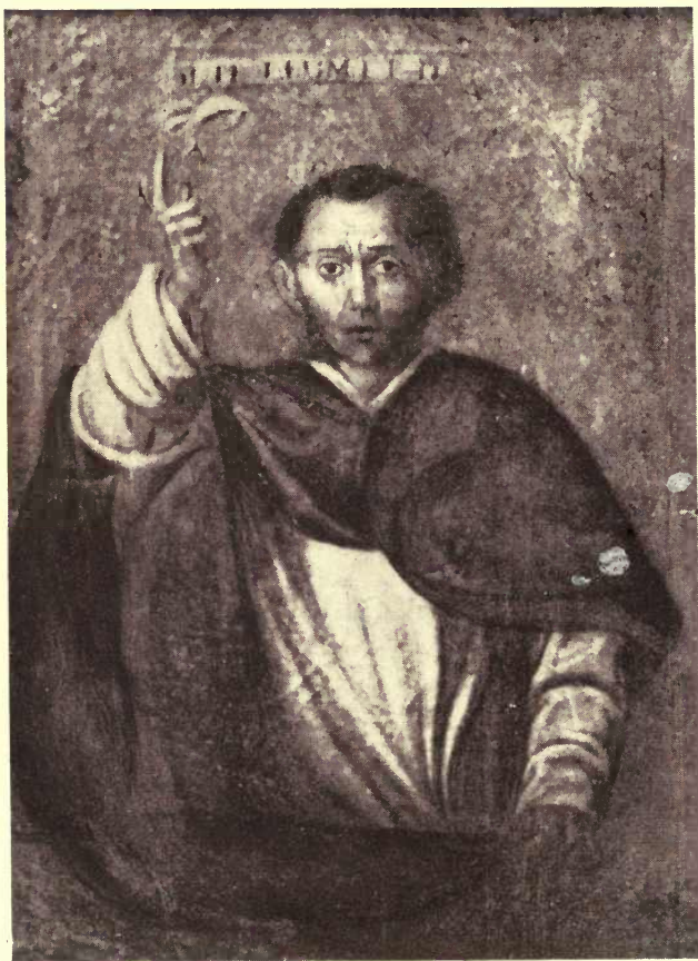
THE MOST AUTHENTIC EXISTING PORTRAIT OF ST. VINCENT FERRER.