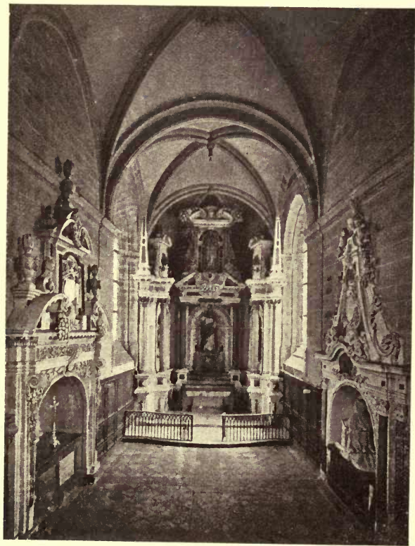
CHAPEL AND SHRINE OF ST. VINCENT FERRER IN THE CATHEDRAL, VANNES.

(The relics are in a coffer beneath the statue of the saint.)