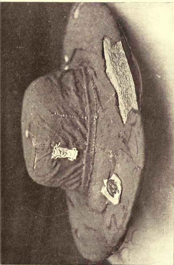
HAT WORN BY ST. VINCENT FERRER. (Preserved in the Dominican Monastery, Lyons.)