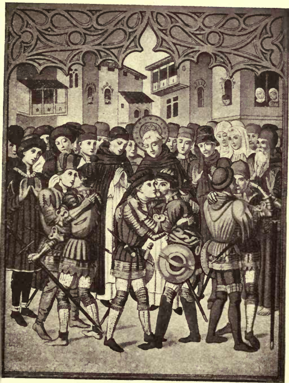
"ST. VINCENT FERRER RECONCILING ENEMIES."